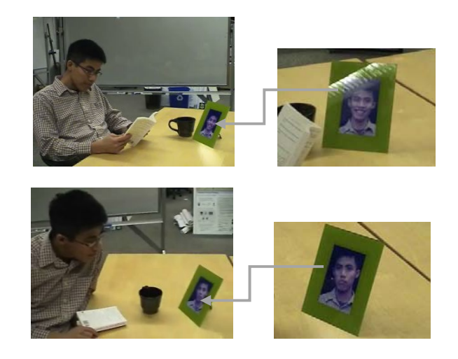
figure 2. When Empathy Mirror in the portrait mode , it is transparent in the physical environment. The photo in the portrait transforms according to the remote partner's emotion status.

Furthermore, the action triggers the transition between two modes. From reflecting your own emotion while you hold it, to reflecting your friend's emotion after you put it back to the table, you'll see the difference, between you and your friend. You'll start to empathize, starting to think about what it would feel like as if you are in your friend's emotion.