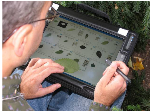
Figure 1: Smithsonian botanist using the Electronic Field Guide prototype, showing the sorted results from automated species identification. Each leaf represents a virtual voucher.

Copyright 2007 ACM 978-1-59593-593-9/07/0004...$5.00.