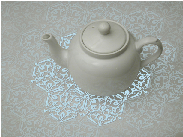
Figure 2: The History Tablecloth

suggests that whether objects are stationary or moving may be interesting to think about. It does not, however, suggest what the implications of this might be: whether it is good for objects to remain in place or move, or what the flow of objects in a home say about its inhabitants' lifestyle or values. These implications are left to its users to decide.