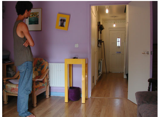
Figure 1: The Key Table

One example of such a system is the Key Table, developed as part of the Equator IRC (Figure 1). The Key Table was designed to support a simple interaction: load sensors supporting the tabletop measure the force with which things are placed on it, and a wirelessly linked picture frame swings out of kilter proportionally to this force. While the behavior of the Key Table is clear – force equals angle of picture frame - how users should make sense of this behavior is not. To see how people would make sense of the Key Table, a volunteer household was recruited to live with it in their home for a month. The target family was mistakenly not told