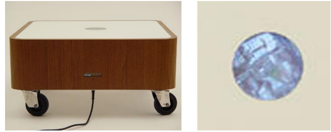
Figure 3: Side (left) and top (right) views of the Drift Table

One way in which designs can suggest new interpretations is by explicitly blocking interpretations that may be obvious or expectable. One example of such a system is the Drift Table (also developed by the Equator IRC) (Figure 3), a coffee table with built-in porthole that allows people to slowly 'drift' over the English countryside [10]. The Drift Table is intended to open new design spaces for technologies as supporting exploration, curiosity, and contemplation, rather than tasks. The Drift Table, in opening new design spaces, is faced with the challenge that users are not likely to come to the system ready to understand it. With their background cultural understanding of technology, users are almost guaranteed to initially interpret the Drift Table as a gadget to