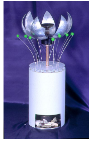
Figure 5: Mateas and Böhlen's Office Plant #1

provide opportunities for reflection on and reinterpretation of the context which users and systems share, but see in different ways.