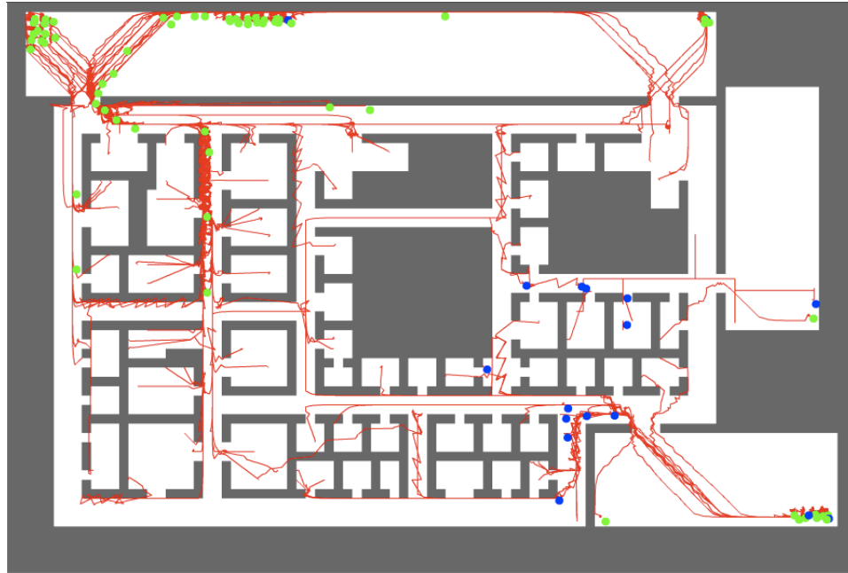
Figure 1 ~ showing the person trails or paths of their movement

Another feature we implemented was the ability to visualize the paths that each person has traveled. (see figure 1) We call this feature "trails," and it enables anyone analyzing the incident with our tool to track the route that each person has taken throughout the incident. Additionally, this will allow for an analysis of the evacuation paths most often used and any potential bottlenecks. We allow for this feature to be toggled on/off and we also incorporated a toggle on/off of the person icons as well. We allowed for these two features to be used in conjunction in order to offer different views of the evacuation.