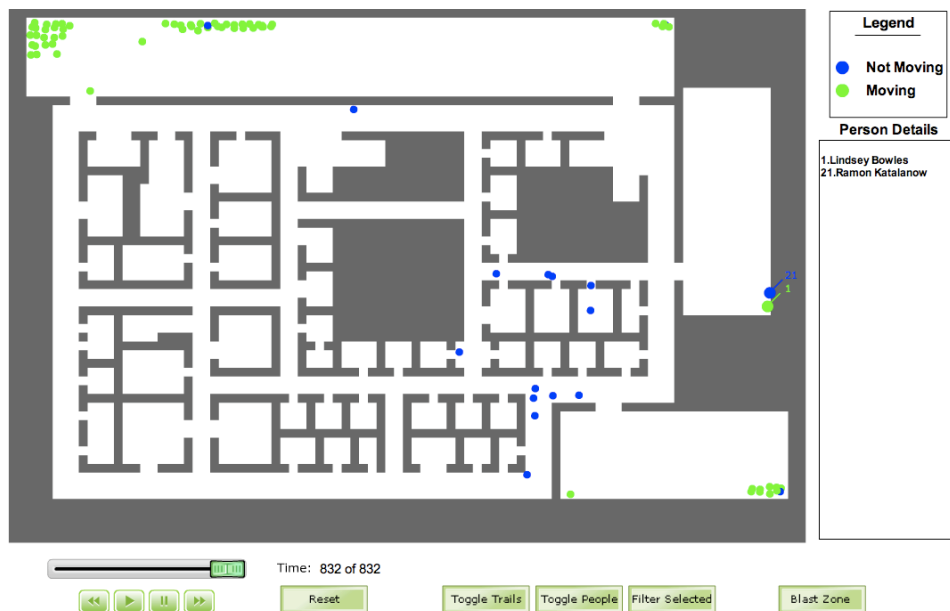
Figure 2 ~ showing the text box with selected individuals

Another feature we implemented was the ability to visualize the paths that each person has traveled. (see figure 1) We call this feature "trails," and it enables anyone analyzing the incident with our tool to track the route that each person has taken throughout the incident. Additionally, this will allow for an analysis of the evacuation paths most often used and any potential bottlenecks. We allow for this feature to be toggled on/off and we also incorporated a toggle on/off of the person icons as well. We allowed for these two features to be used in conjunction in order to offer different views of the evacuation.