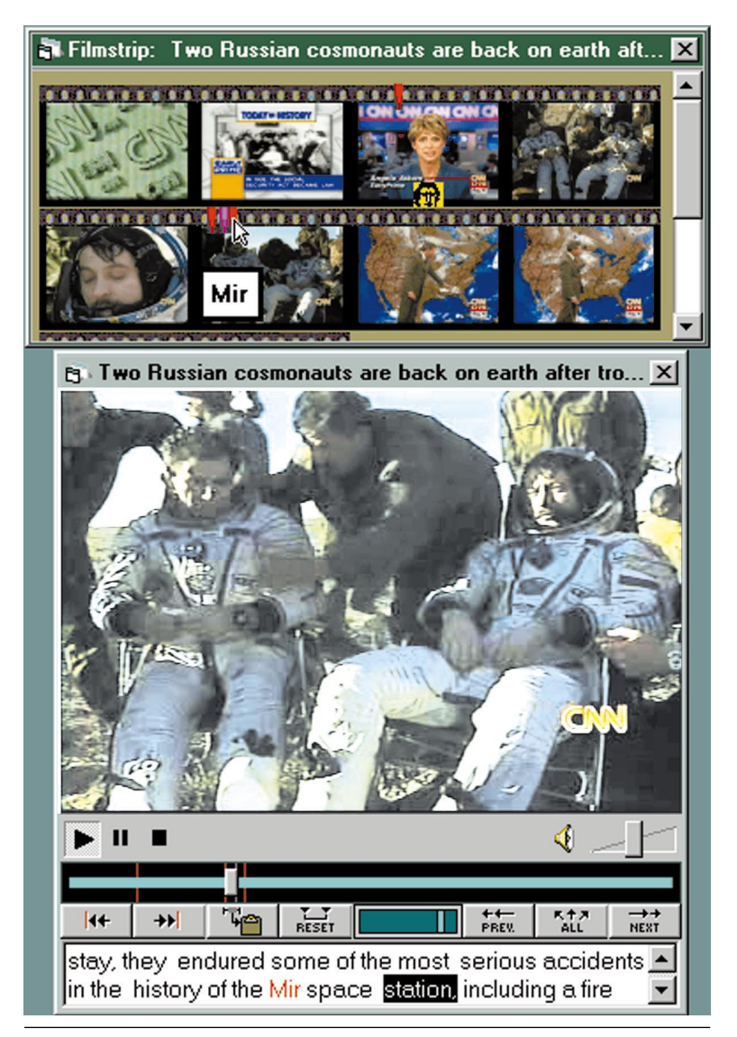
Figure 3. Filmstrip and video playback windows for a result from the query for "Mir collision."

We developed a temporal multimedia abstraction, the video skim , which is played rather than viewed statically. A skim incorporates both video and audio information from a longer source so that a twominute skim, for example, may represent a 20-minute