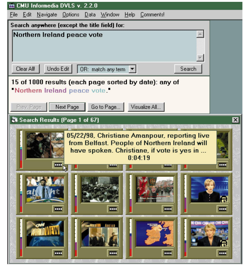
Figure 1. Query input and result set interface for the Informedia digital video library.

Data from these instruments and forums collectively forms the basis for the discussion that follows.