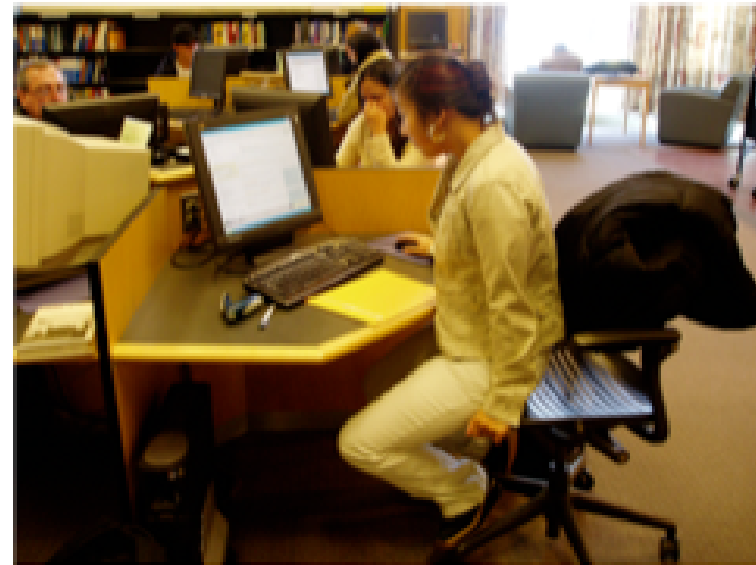
MIT student completing “information-seeking” diary study in a library, 2006

http://libstaff.mit.edu/webgroup/userneeds/index.html