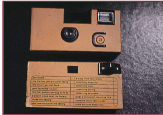
Figure 4. Camera