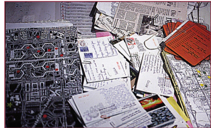
Figure 6. Some of the returned items.

Looking for semantic patterns in visual data