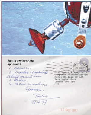
Figure 2. A postcard ("what is your favorite device?")