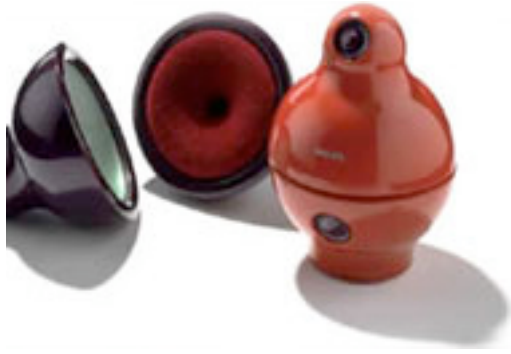
Figure 3. Concept from Philips' vision of the future project.

extensible, as numerous undergraduate and graduate programs in interaction design have imitated the project.