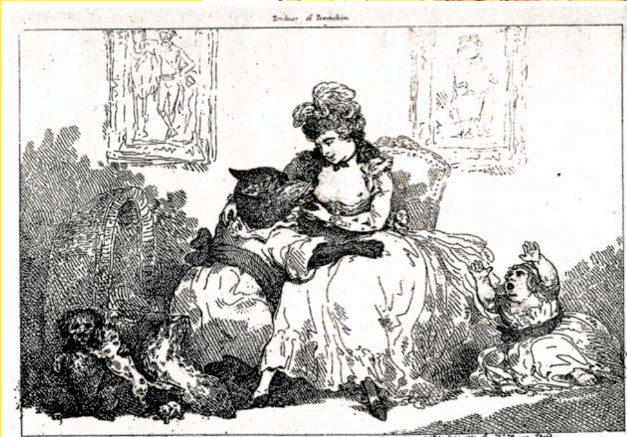
POLITICAL AFFECTION. 2nd April 1846