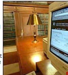
The New York Public Libr