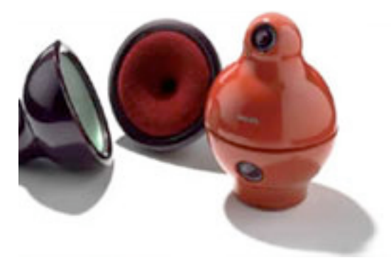
Figure 3. Concept from Philips' vision of the future project.

extensible, as numerous undergraduate and graduate programs in interaction design have imitated the project.