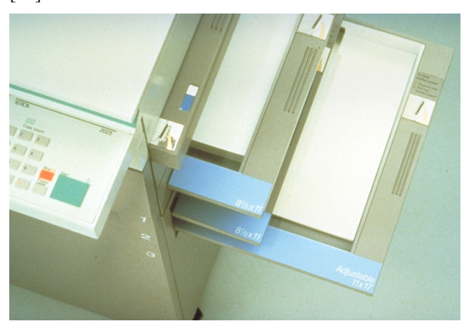
Figure 2. Xerox prototype machine.

indicated specific touch points. Finally, the prototypes provided concrete illustrations of how to provide instructions at the point of need. Evaluations of the prototypes revealed a shift in work practice that came about as a result of the new way of interacting with the machines [20].