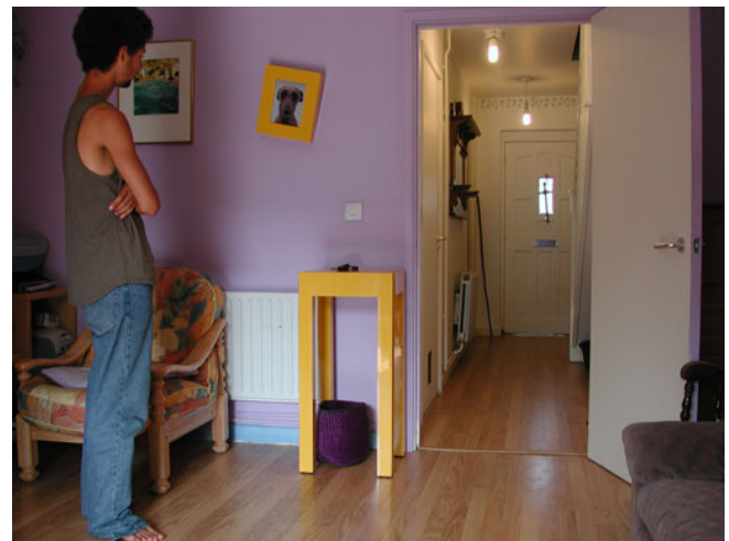
Figure 1: The Key Table

One example of such a system is the Key Table, developed as part of the Equator IRC (Figure 1). The Key Table was designed to support a simple interaction: load sensors supporting the tabletop measure the force with which things are placed on it, and a wirelessly linked picture frame swings out of kilter proportionally to this force. While the behavior of the Key Table is clear – force equals angle of picture frame - how users should make sense of this behavior is not. To see how people would make sense of the Key Table, a volunteer household was recruited to live with it in their home for a month. The target family was mistakenly not told