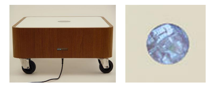
Figure 3: Side (left) and top (right) views of the Drift Table

One way in which designs can suggest new interpretations is by explicitly blocking interpretations that may be obvious or expectable. One example of such a system is the Drift Table (also developed by the Equator IRC) (Figure 3), a coffee table with built-in porthole that allows people to slowly 'drift' over the English countryside [10]. The Drift Table is intended to open new design spaces for technologies as supporting exploration, curiosity, and contemplation, rather than tasks. The Drift Table, in opening new design spaces, is faced with the challenge that users are not likely to come to the system ready to understand it. With their background cultural understanding of technology, users are almost guaranteed to initially interpret the Drift Table as a gadget to