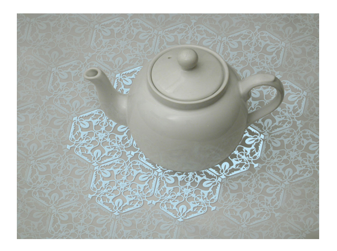
Figure 2: The History Tablecloth

suggests that whether objects are stationary or moving may be interesting to think about. It does not, however, suggest what the implications of this might be: whether it is good for objects to remain in place or move, or what the flow of objects in a home say about its inhabitants' lifestyle or values. These implications are left to its users to decide.